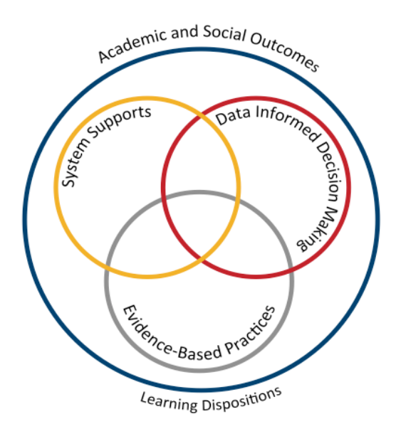
Diagram 1: Adapted from School-wide Positive Behaviour Support: implementers' blueprint and Self- Assessment, by OSEP Centre On Positive Behavioural Interventions and Supports, 2004, Eugene OR: Lewis